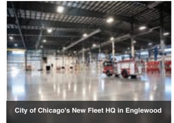
City of Chicago's New Fleet HQ in Englewood