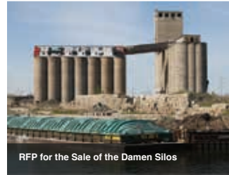
RFP for the Sale of the Damen Silos