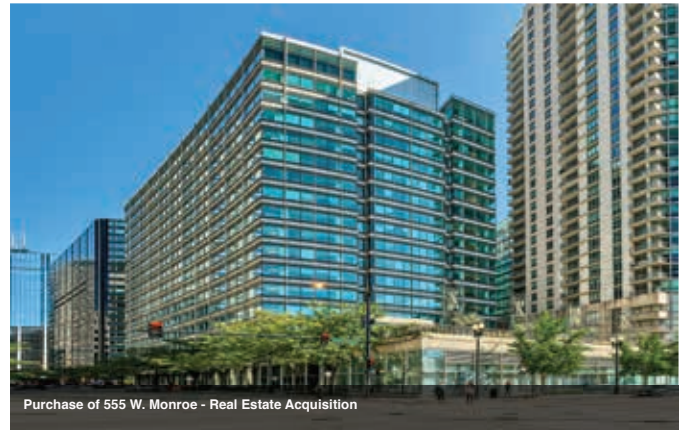
Purchase of 555 W. Monroe - Real Estate Acquisition