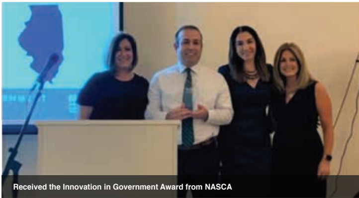
Received the Innovation in Government Award from NASCA